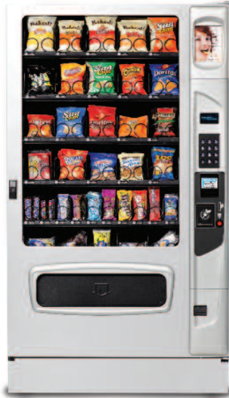
M5000 Shown with silver door color & kick panel options.