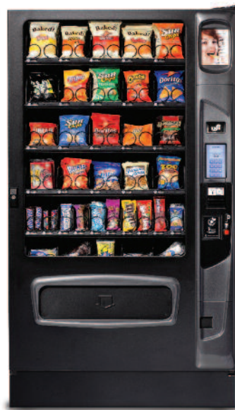
M5000 Shown with iCart touch screen & kick panel options.