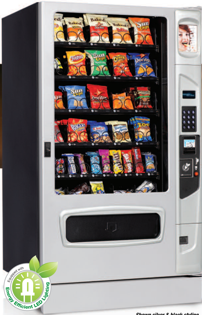
Shown silver & black styling and kick panel options.

The Mercato 5000 glass front snack merchandiser incorporates all the proven features you expect in a new design and includes additions that increase the value for choosing USI.