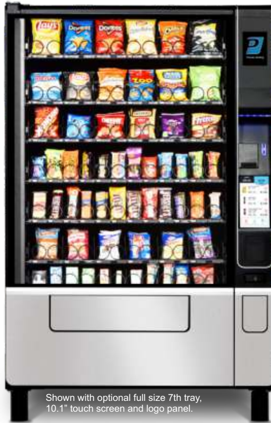
Shown with optional full size 7th tray, 10.1" touch screen and logo panel.