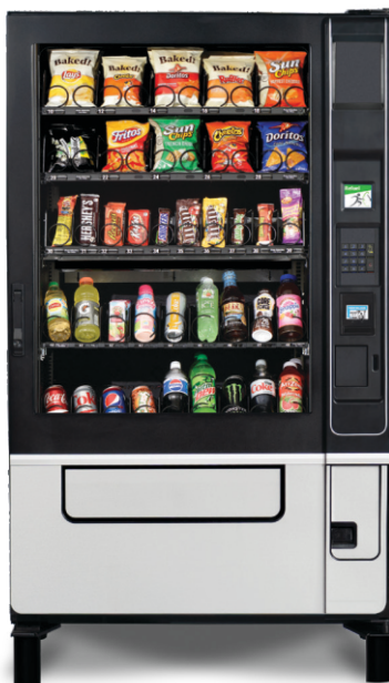
Evoke Combo VT5 shown with standard 3.5" Display, Braille Identified Keypad and Leg Covers